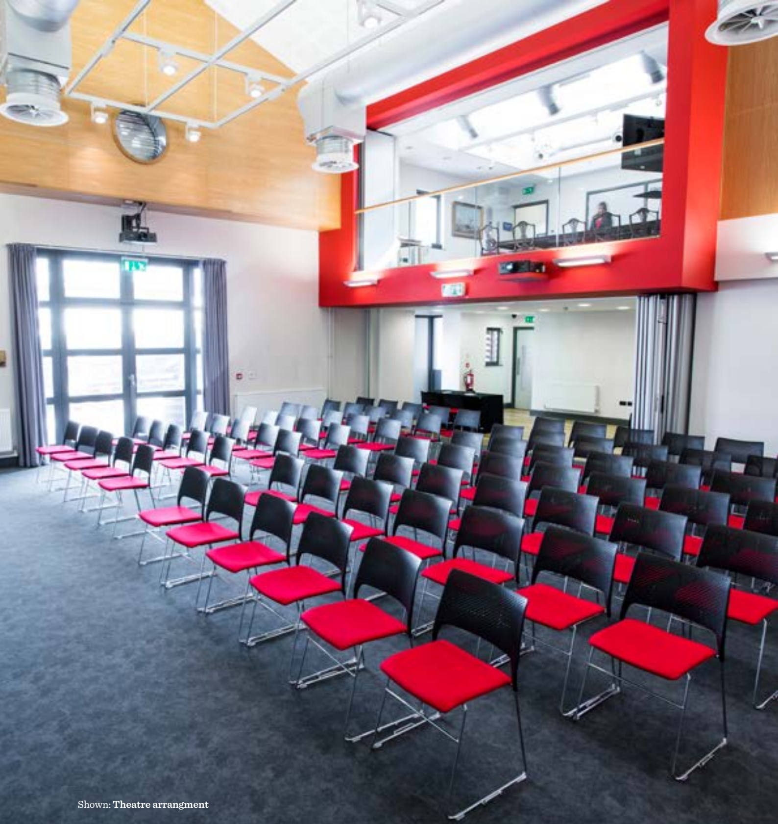
Shown: Theatre arrangement