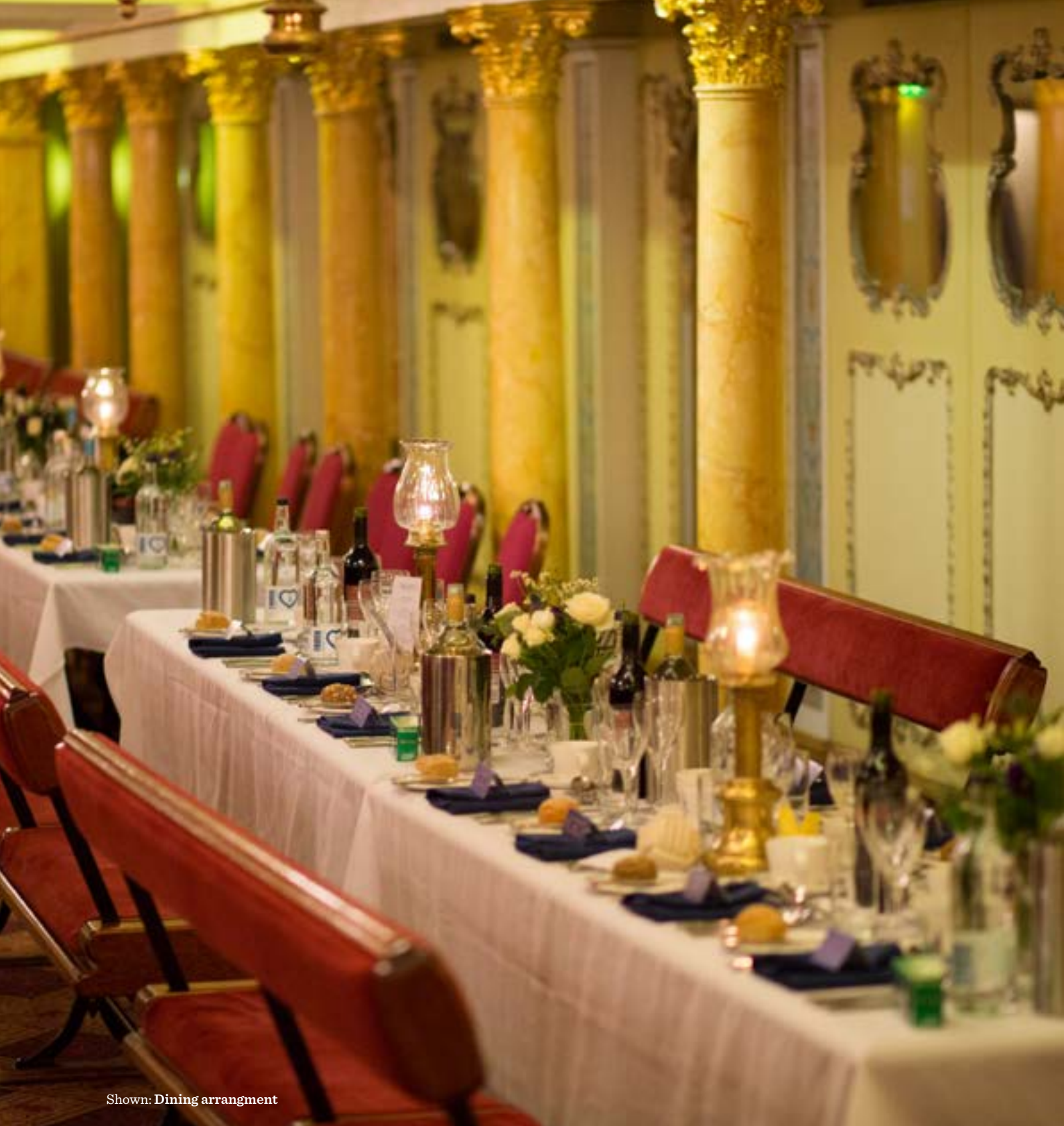
Shown: Dining arrangement