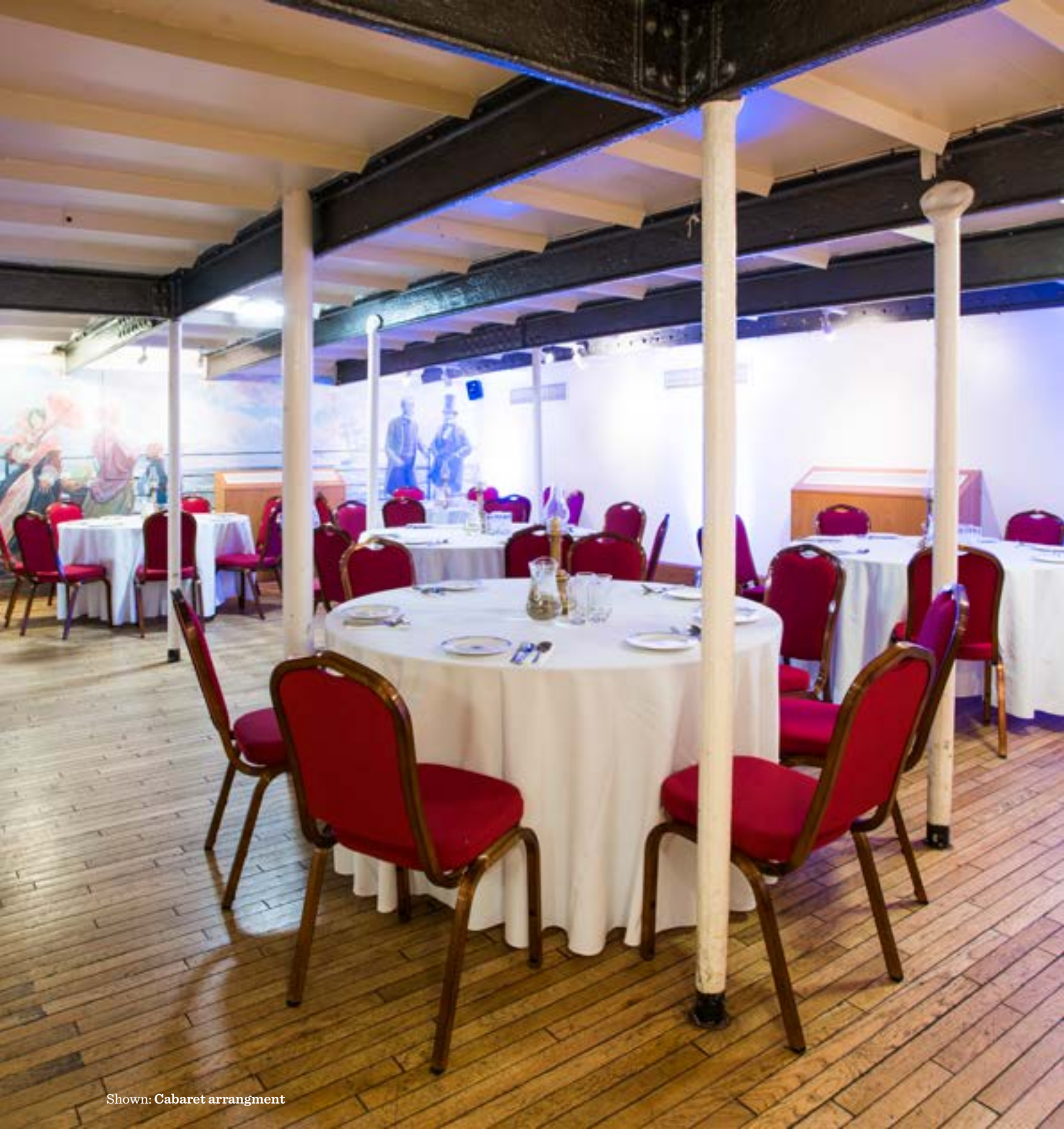
Shown: Cabaret arrangement