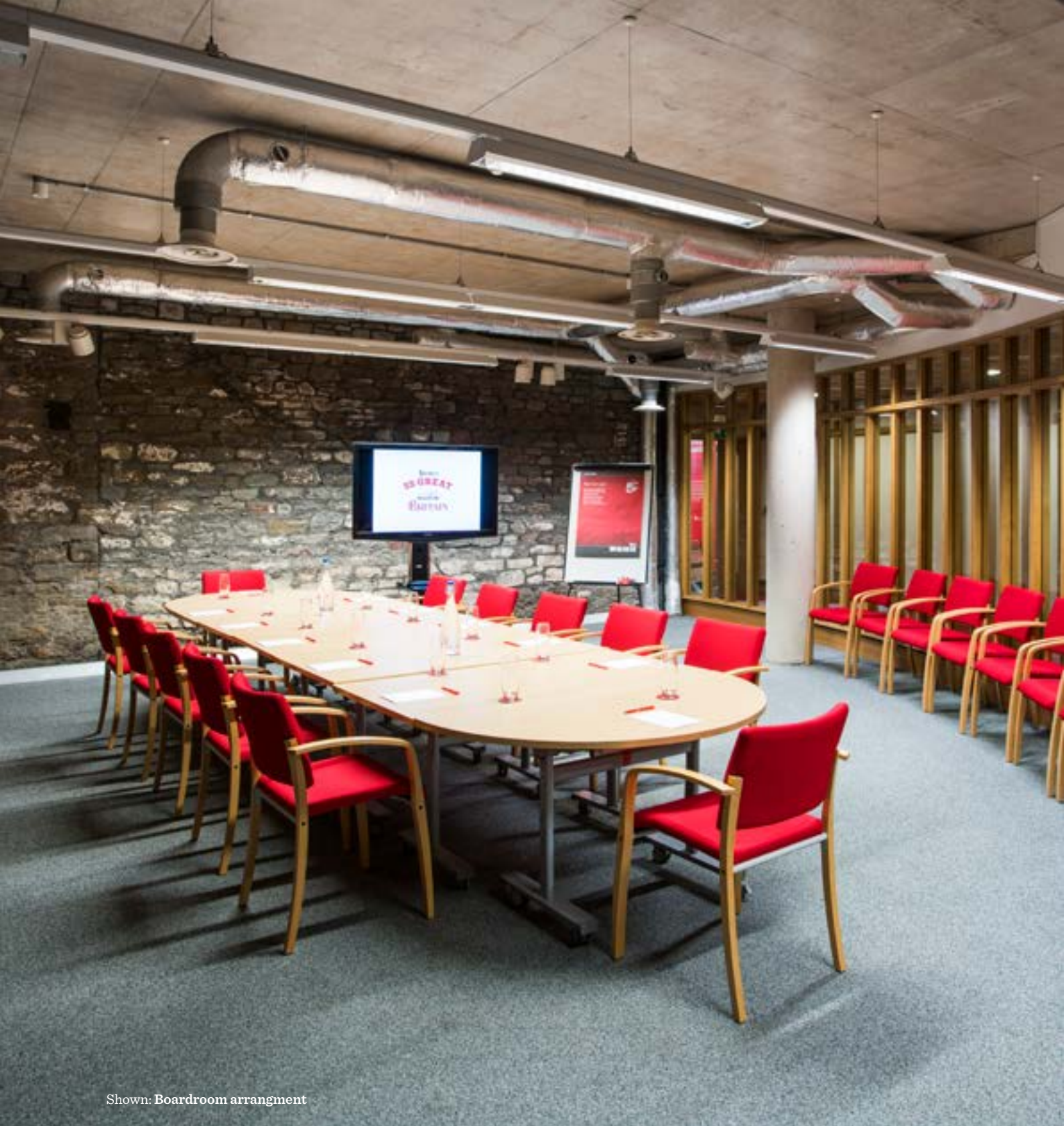
Shown: Boardroom arrangement