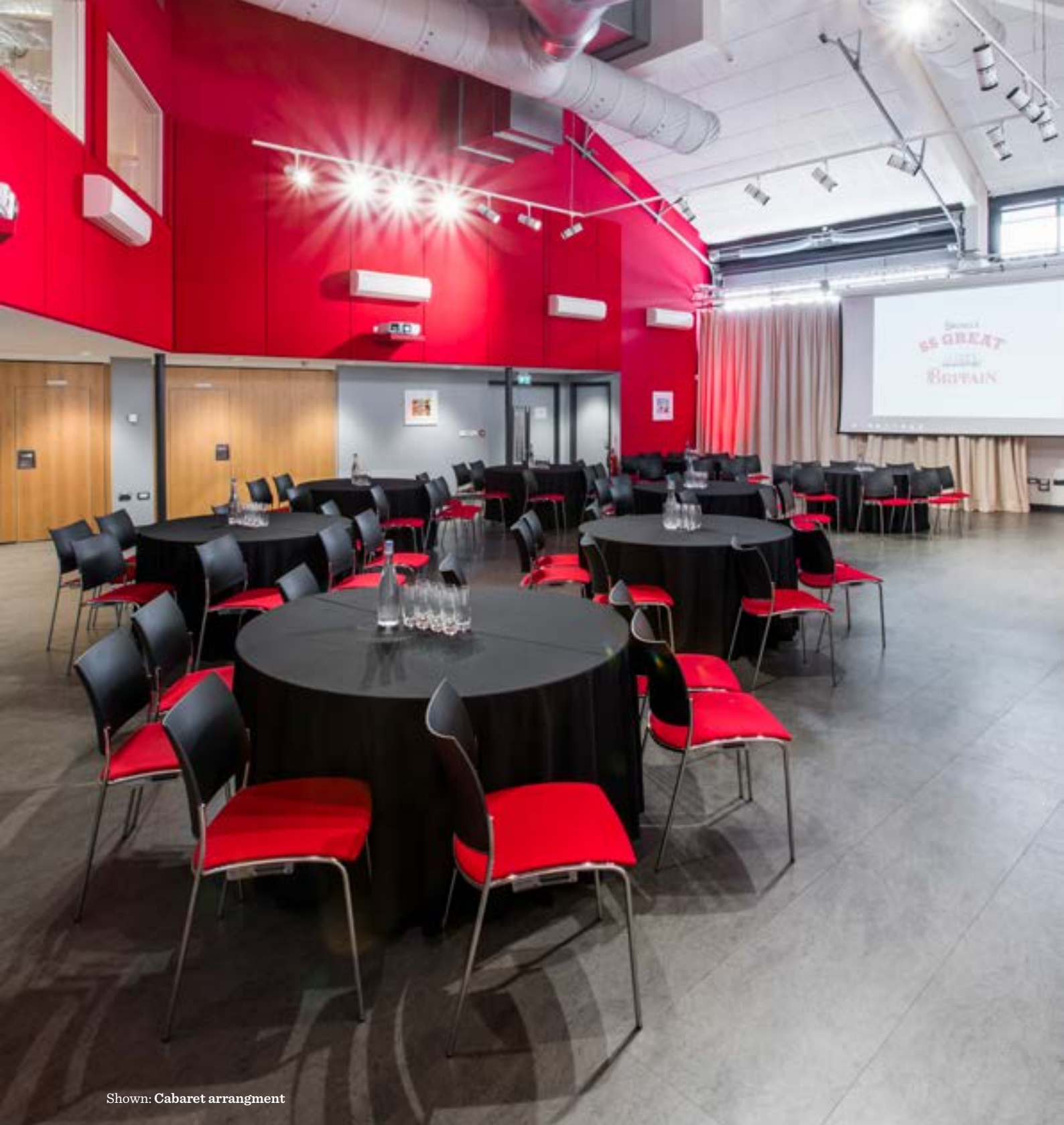
Shown: Cabaret arrangement