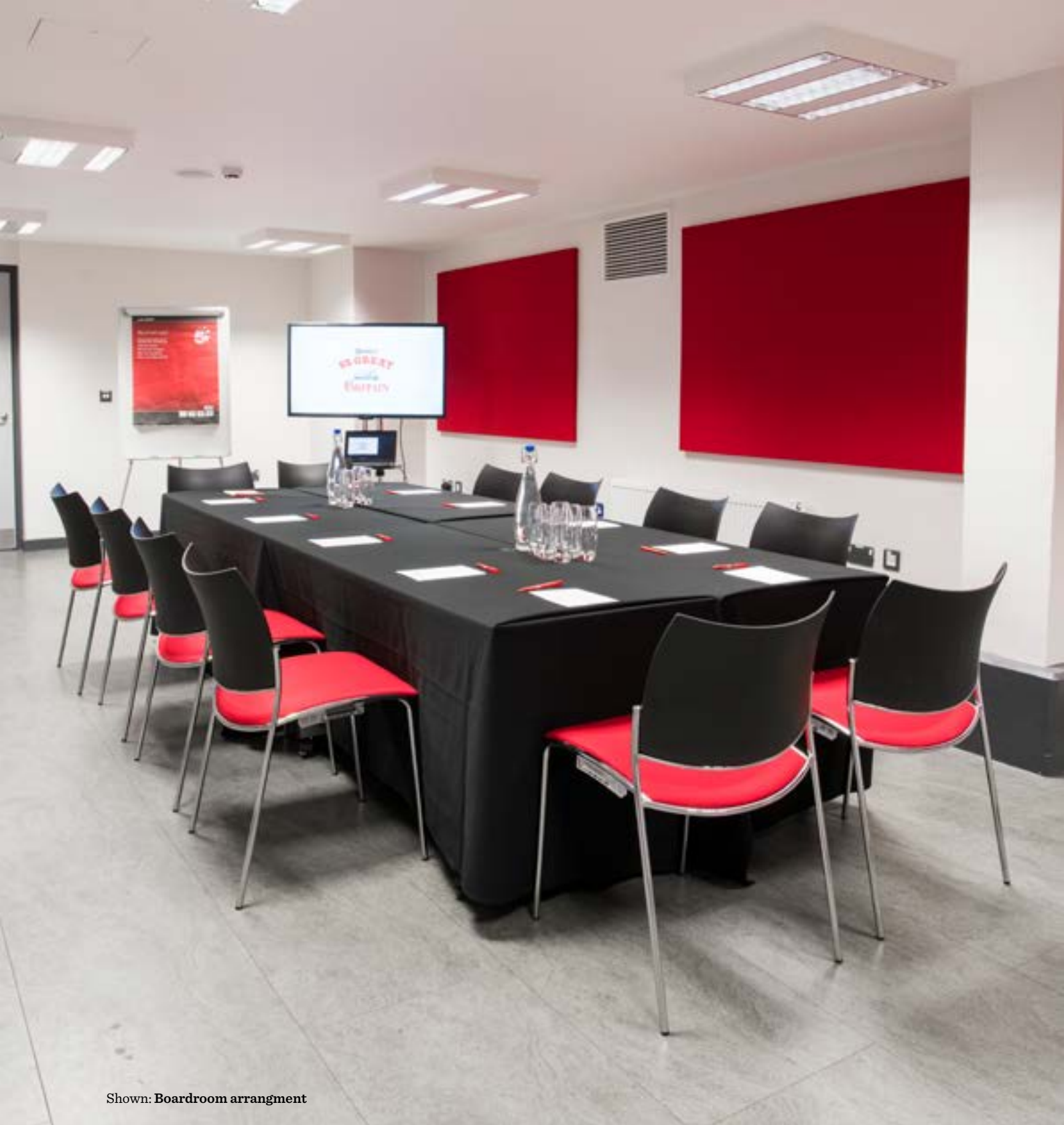
Shown: Boardroom arrangement