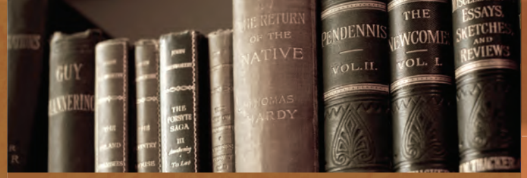
Books & Stamps

is home to 120 art-related businesses including 4 theatres 9 art galleries, 38 studios and workshops, 19 designers and architects, 25 shops selling arts & craft, a society of artists and musicians and the award winning Hotel Du Vin.