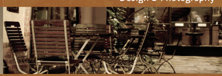
Cafes / Restaurants / Pubs